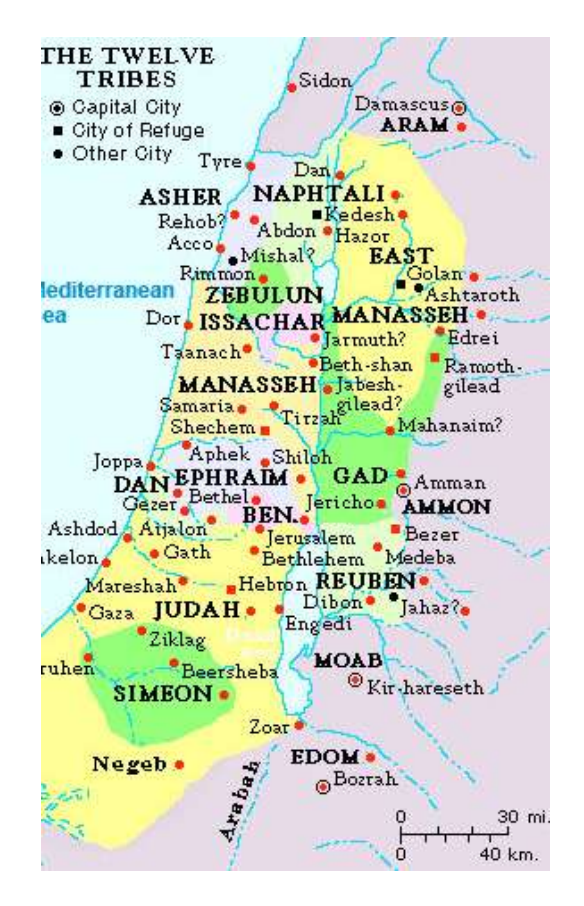
Page 3 of 11; Given @ the Lighthouse Church Inc.; 7/22/12

A deep and affectionate passion is being imparted to the Christian Church for the land of Israel and the natural seed of Abraham. Even as Esther sanctified and adorned herself in her royal attire, so is the Bride of Christ in order to come boldly before the Throne of Grace to obtain mercy for the land of Israel and find divine help in time of need.